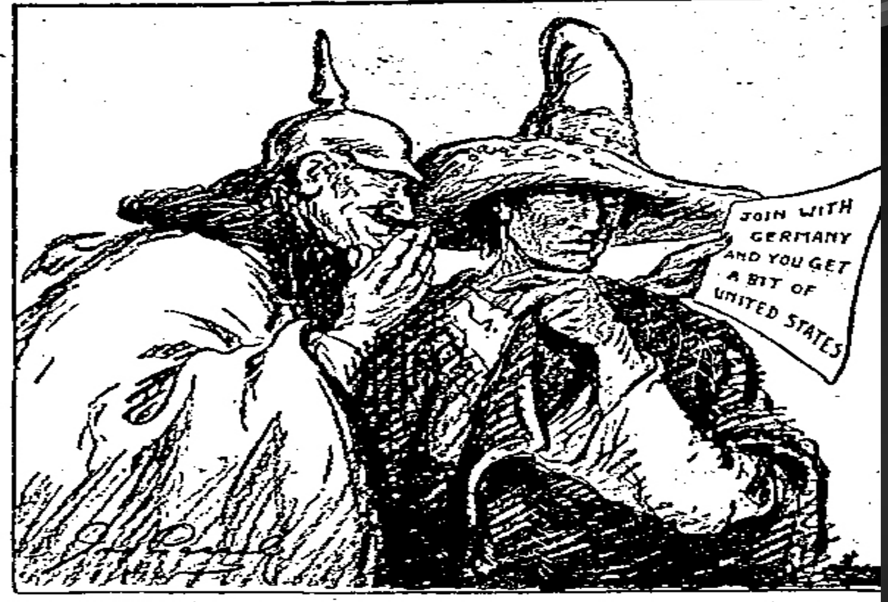
SOME PROMISE!